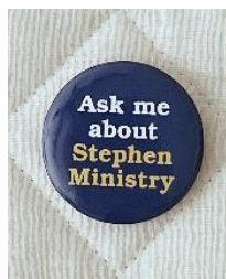
Button identifying those involved with Stephen Ministry to those seeking care.

It is impossible to overstate the importance of the Lookouts in this process – a handful of Church leaders and Stephen Ministers simply can't be everywhere all the time. The ongoing success and growth of our Stephen Ministry will, in large part, depend on our network of trained, passionate Lookouts – individuals who want to extend a hand in any way they can to help others who are struggling in the mud pit of life. If you aren't interested in being a Stephen Minister or would like to but aren't sure yet or can't commit to the time requirement, please consider becoming a trained Lookout when the call goes out next spring.